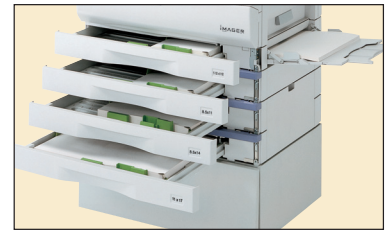
AR-M207E shown with optional paper trays, for a total online paper capacity of 1,100 sheets.

Add powerful fax functionality to the AR-M162E/M207E with the Super G3 fax module. With 350 Auto-Dial numbers and Broadcasting Capability up to 200 destinations, the AR-M162E/M207E IMAGERs can easily handle high-volume faxing environments.