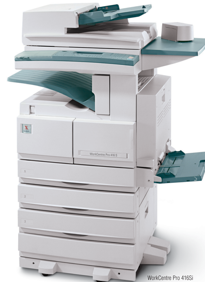
WorkCentre Pro 416Si Multifunction System

The office assistant that works for you and your bottom line