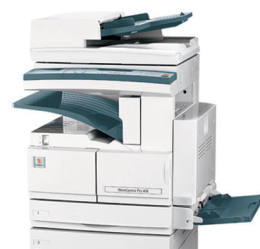
WorkCentre Pro 416Pi Duplex Printer-Copier